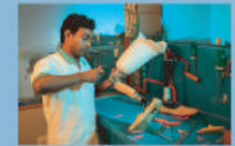
Prosthetics & Orthotics

The rehabilitation department is considered to be a vital core element of the hospital with one of the largest teams of therapists, trained in some of the best institutes of India and abroad. It offers complete facilities of physiotherapy, occupational therapy which provides guidance for patients to lead a productive, self-reliant life followed by vocational training which offers the SCI patients with a new hope and confidence of running their households in a specific vocational area.